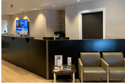
Upper West Side 2689 Broadway, New York, NY 10025 (212) 776-4320